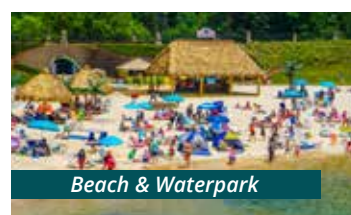
Beach & Waterpark