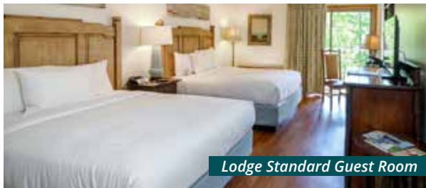
Lodge Standard Guest Room