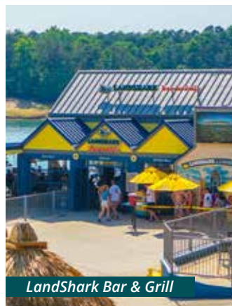
LandShark Bar & Grill