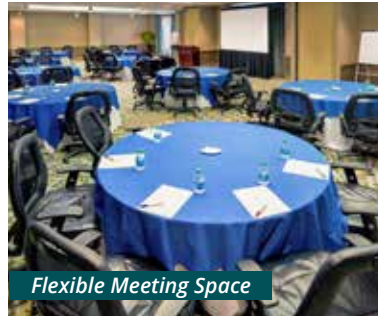
Flexible Meeting Space