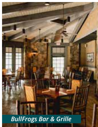
BullFrogs Bar & Grille