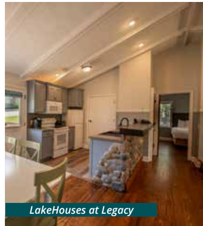
LakeHouses at Legacy