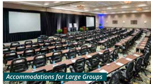
Accommodations for Large Groups