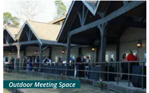
Outdoor Meeting Space