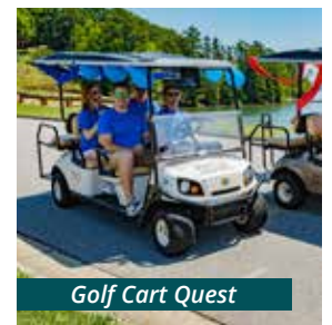
Golf Cart Quest